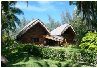
Ecologic center Meridien - Bora Bora

Since 2011, each year four grants have been awarded to early career scientists (<35 years old) of any nationality to conduct a scientific project based at the CRIOBE facilities in Moorea, French Polynesia. The candidates are selected by the IRCP scientific committee, which includes some members of the Secretariat of the Pacific Community (SPC). Among the candidates selected each year, at least one candidate will come from South Pacific Island States in order to promote training for scientific research in these countries.