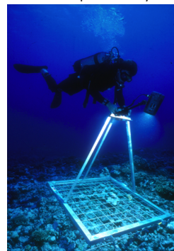
Setting up of a quadrat

Who are the scientists that participate in the Polynesia Mana monitoring with you?